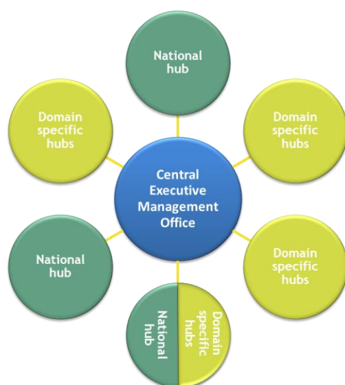
Figure 6. HIREP-ERIC organisational structure

The HIREP-ERIC nodes, national or international research institutes, which enter into a collaboration agreement with the HIREP-ERIC, provide the delivery of technical services and interoperability. Each HIREP-ERIC node is hosted by an institute that has its own legal personality and provides a defined set of services on behalf of or for the HIREP-ERIC. These services and the terms and conditions of their delivery are specified in Collaboration Agreements entered into by the HIREP-ERIC nodes and the Central Executive Management Office.